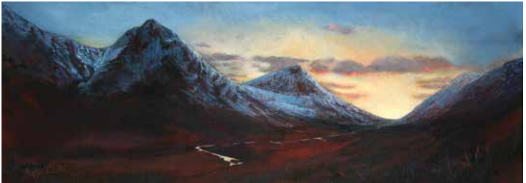
Winters' Evening Glencoe