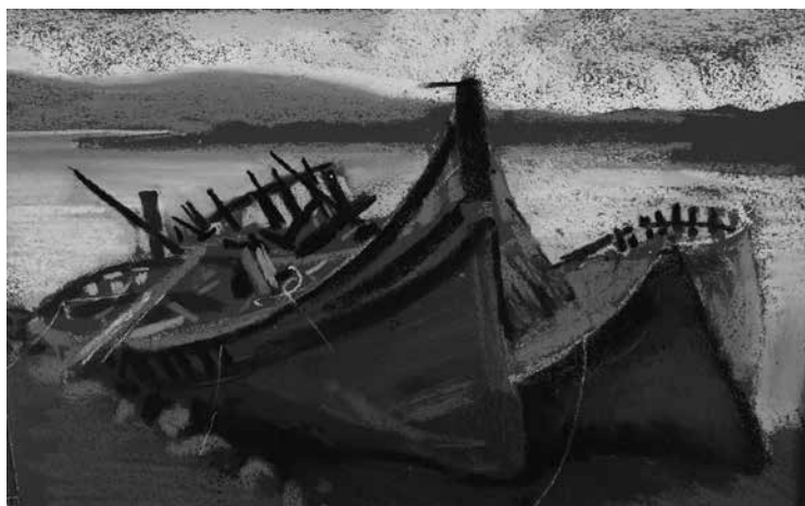
Old Haunts, Salen, Mull