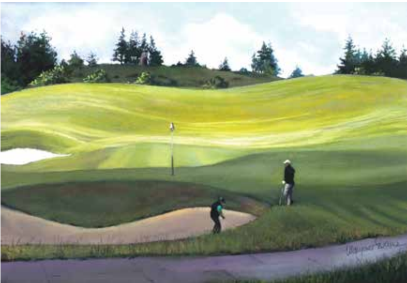
Final Bunker 18th PGA