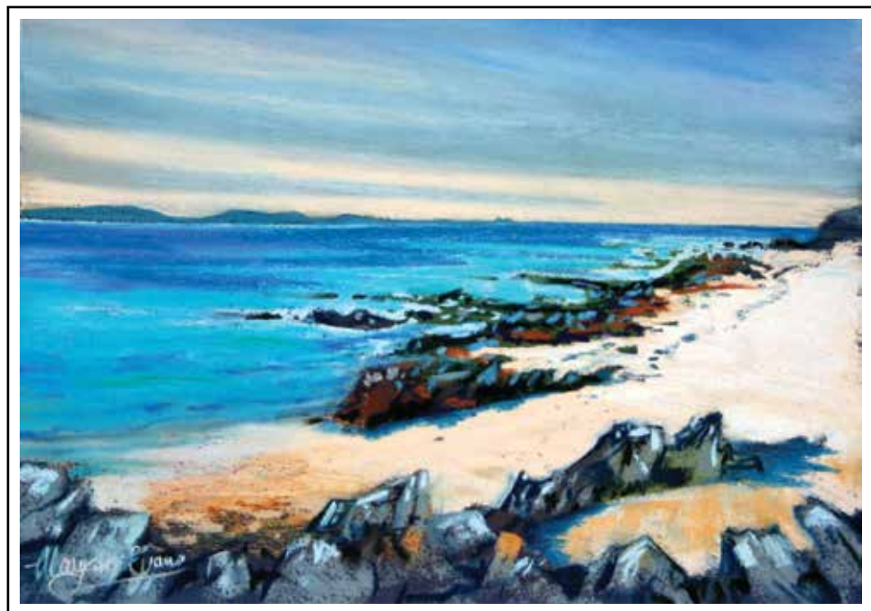
Iona Beach 2